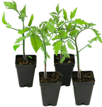
SHIPPED IN 2.5-INCH POTS. PLANT SIZE MAY VARY BASED ON GROWING CONDITIONS.

Note: Some leaves may appear wilted or yellow upon arrival. This is due to the stress of shipping and is nothing to worry about. Water the plant and let it recover in a shady location for a few days, then gently remove any foliage that does not recover to allow for new growth.