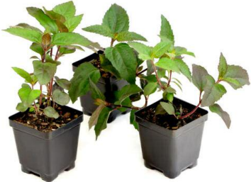
SHIPPED IN 3.25-INCH POTS. PLANT SIZE MAY VARY BASED ON GROWING CONDITIONS.

Note: Some leaves may appear wilted or yellow upon arrival. This is due to the stress of shipping and is nothing to worry about. Water the plant and let it recover in a shady location for a few days, then gently remove any foliage that does not recover to allow for new growth.