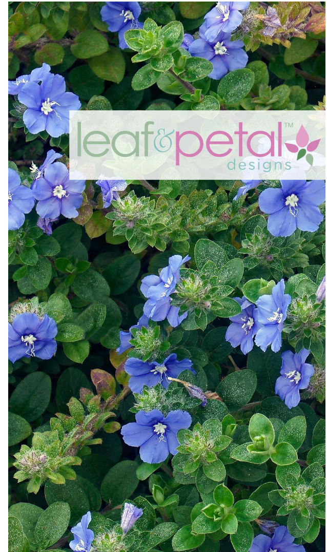
DWARF MORNING GLORY

In case of ingestion contact a poison control center immediately. 1-800-222-1222