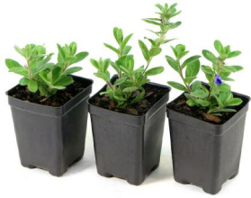
SHIPPED IN 2.5-INCH POTS. PLANT SIZE MAY VARY BASED ON GROWING CONDITIONS.

Note: Some leaves may appear wilted or yellow upon arrival. This is due to the stress of shipping and is nothing to worry about. Water the plant and let it recover in a shady location for a few days, then gently remove any foliage that does not recover to allow for new growth.